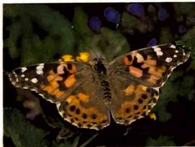
Painted Lady (Vanessa cardui)