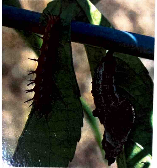
Gulf Fritillary Butterfly