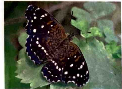
Texan Crescent (Phyciodes texana)