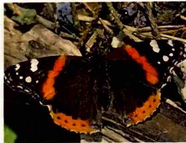
Red Admiral (Vanessa atalanta)