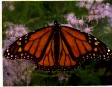
Monarch (Danaus plexippus)