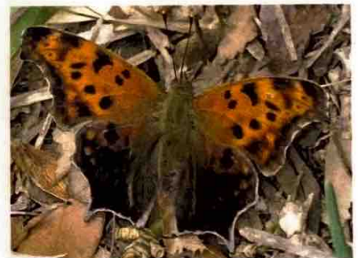
Question Mark (Polygonia interrogationis)