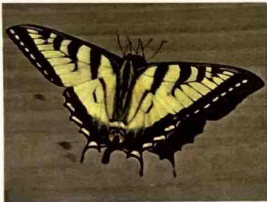
Tiger Swallowtail (Papilio glaucus)