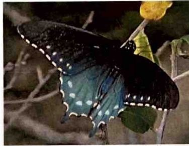
Pipevine Swallowtail (Battus philenor)