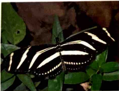
Zebra Longwing (Heliconius charitonius)