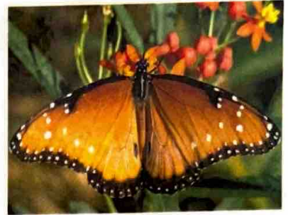
Queen (Danaus gilippus)