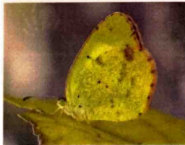
Little Sulphur (Eurema lisa)