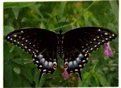
Black Swallowtail (Papilio polyxenes)