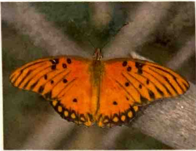
Gulf Fritillary (Agraulis vanillae)