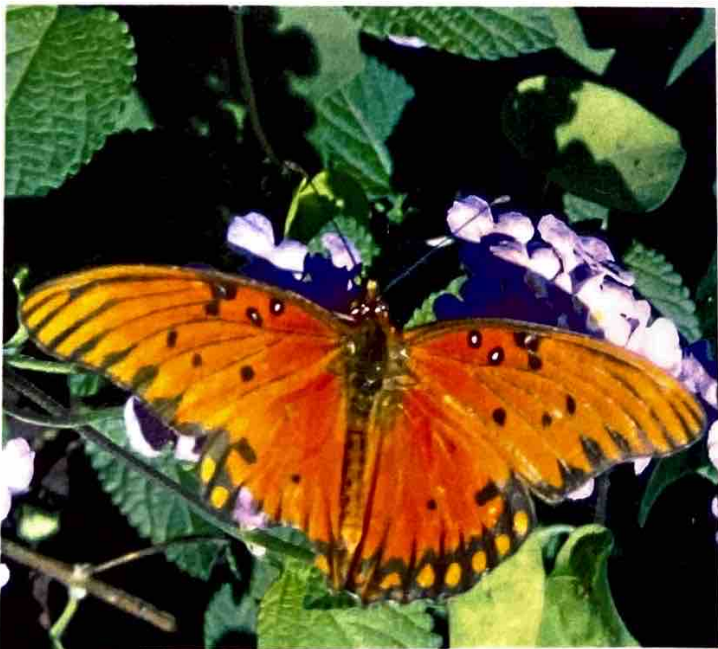
Variegated Fritillary Butterfly