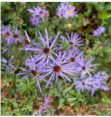
Fall Asters Symphotridium cordifolium