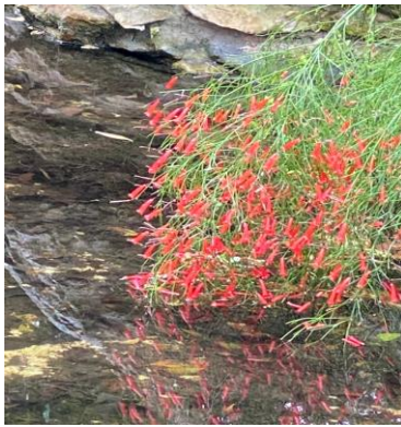
Firecracker Fern, Russelia equisetiformis